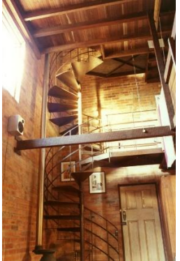
1976 Raphael Street townhouses (Architecture Australia, September 2012).